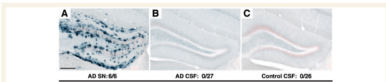
Figure 2 Human CSF does not induce cerebral \beta -amyloidosis. The soluble fraction of an Alzheimer's disease brain extract (supernatant, see Fig. 1) and undiluted human CSF were injected into young, pre-depositing 3- to 4-month-old APP23 transgenic mice (2.5 \mu l bilaterally). Brains were immunohistochemically analysed for amyloid- \beta deposition after a 6–8 month incubation period (Supplementary Table 1). (A) The supernatant (SN) fraction of an Alzheimer's disease patient induced the expected amyloid- \beta deposition (see Fig. 1A). (B and C) Neither CSF from Alzheimer's disease patients (shown is A023) nor control subjects (shown is A009) revealed any amyloid- \beta deposition. CSF from eight Alzheimer's disease patients and six control subjects was tested in 2–10 mice per CSF sample. Two CSF samples were tested both fresh and frozen (for details see Supplementary Table 1). The total number of animals with induced amyloid- \beta deposition/total number of animals tested is indicated. Scale bar = 200 \mu m. AD = Alzheimer's disease.

Selected CSF samples (Alzheimer's disease and control subjects) were also concentrated 15-fold using a Speed Vac concentrator but also the concentrated samples did not induce amyloid- \beta deposition 6 months later ( n = 3 ; results not shown).